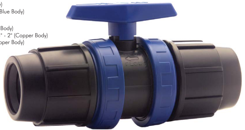
Ball Valves Pressure Loss