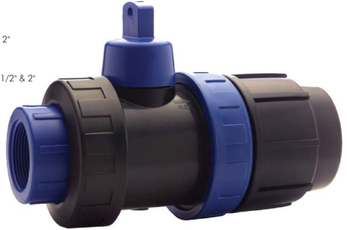
Curb Stops Pressure Loss