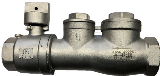
1-1/4" SS Curb Stop / Swing Check Valve FNPT