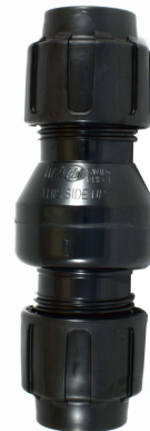
1-1/4" IPS PVC SWING CHECK