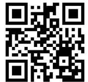
QR Installation Video